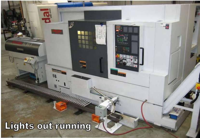
Lights out running